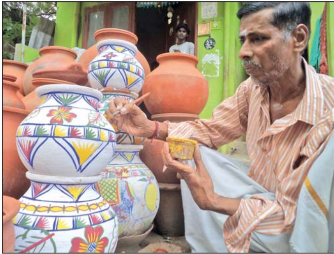
Prices of pots range from Rs. 20 to 120. He also sells lamps and fire-wood stoves. He can be contacted in phone 98408 25781.