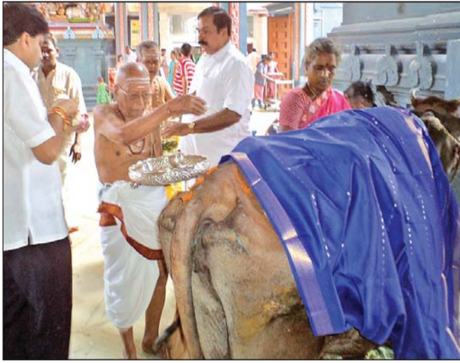
By Our Staff Reporter

There were reports from several offices that furniture shook for some seconds. Many came out of their offices but went back later.