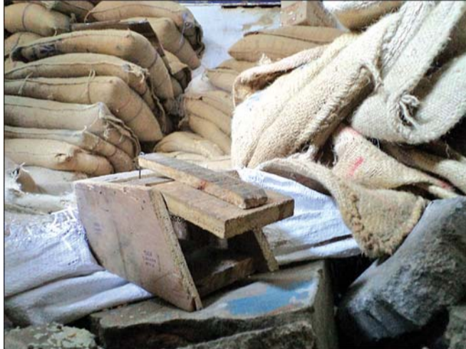
They appealed to the authorities concerned to repair the floors to prevent the rats from entering the shops.

By Our Staff Reporter Staff of TUCS ration shops at the junction of Dr. Nair Road and Theagaraya Road in T. Nagar lay traps for rats before closing the shops in the evening everyday as the rodents damage provisions during the night. The shops in-charge told Mambalam Times that the rats manage to enter the shops through holes in the broken flooring. Staff said that 2 rats are caught daily but this has not stopped the menace.