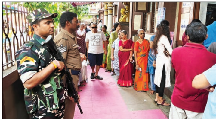
Special security at polling booths