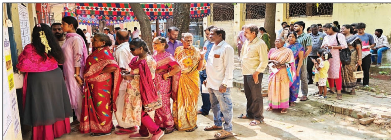
Voters queue outside Thakkar Bapa Vidyalaya (T. Nagar)

A conservancy worker near Ashok Pillar said that they rest during peak afternoon hours at the nearby metro station before resuming work. Similar is the plight of Metrowater and TNEB workers who have to brave the sun to attend complaints.