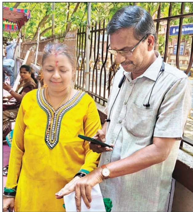
A couple take a photo of their inked finger after casting their vote at a polling station in West Mambalam