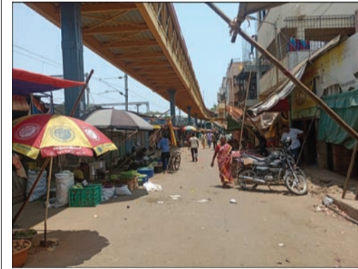
Vegetable wholesale market