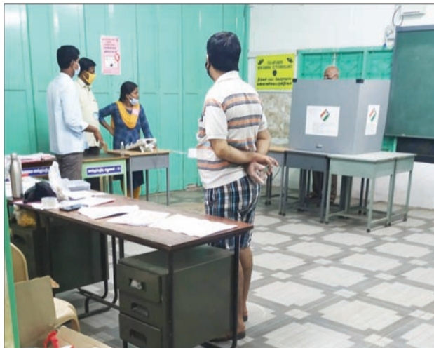
The inside view of a polling station