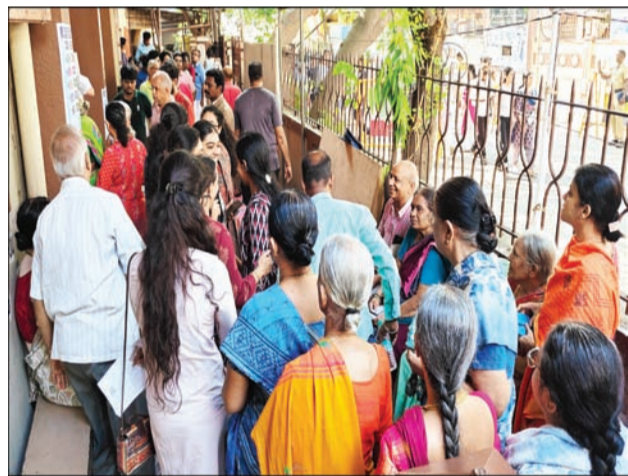
Long queue of voters at 10 a.m at Anjuham School (West Mambalam)