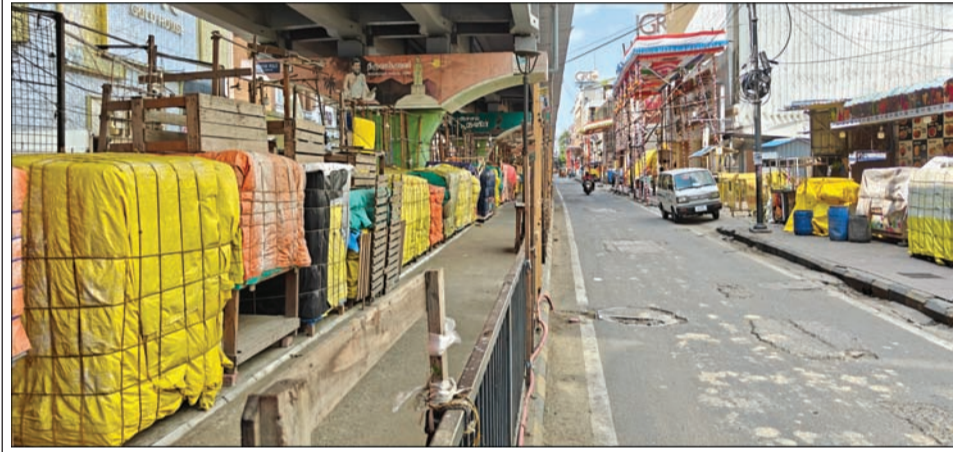
South Usman Road