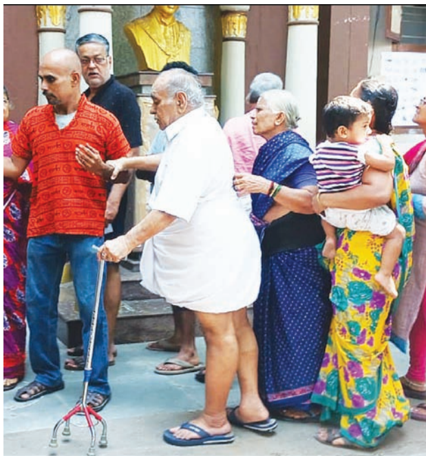
75-year-old man with a walking stick was helped by his son at the polling booth in Anjugam School (West Mambalam)